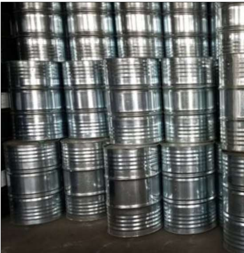
Barrels of CFC-11 chemical.

Low cost Chinese home insulation, which is used to keep houses warm in cold weather, is being blamed for a huge rise in emissions of a gas, highly damaging to the Earth's protective ozone layer.