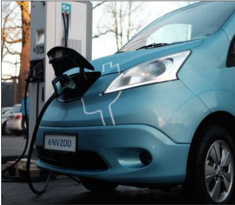
Pictured: A car charging at an electric pump.

New homes being built in England may need to be fitted with electric car charging points under a government suggestion to cut damaging CO2 emissions.