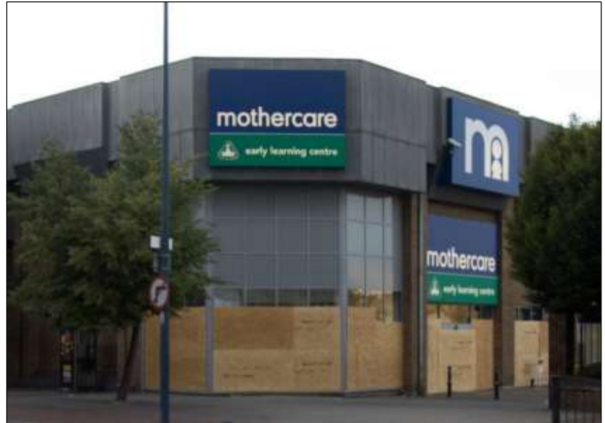
Pictured: A recently closed Mothercare shop.

Mothercare has been affected by issues faced by many town shops including less people spending money in high street shops and the increase in people choosing to shop online.