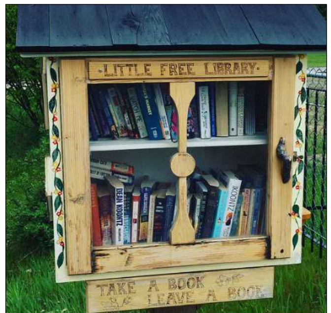
Pictured: A typical little free library wooden box.

"With 75,000 Little Libraries around the world, we estimate that 54 million books will be shared this year alone and 900,000 neighbours will meet each other for the first time," says Todd Bol who created the charity in 2009. "But book access remains a critical challenge in so many communities around the country. We believe everyone has the right to read, and we want to help make that a reality."