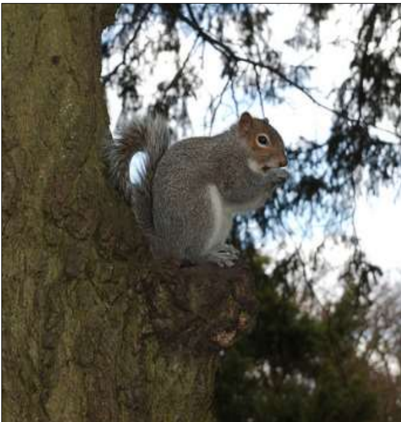
Pictured: A typical Grey Squirrel.

Five squirrels whose tails became tangled together in a "Gordian Knot" (a metaphor for a difficult problem which can be solved with creative thinking) in their nest have been freed by a wildlife team in Wisconsin, in USA. The group of young grey squirrels were found with their tails entangled together with the grass and plastic their mother had used as nest material. An animal rehabilitation team spent 20 minutes trying to delicately cut apart the tails to avoid hurting any of the young rodents. The wildlife rehabilitation centre team announced on their Facebook page that the squirrels have made a good recovery, with the group reporting that a day later "they are all bright-eyed, and three of the five are 'bushy-tailed'".